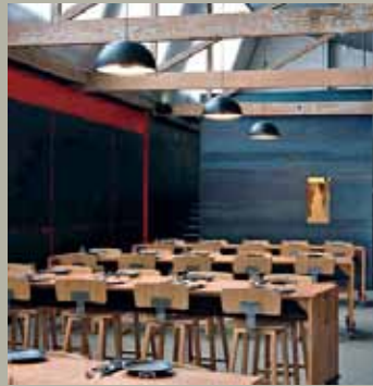
CULTURAL + COMMERCIAL