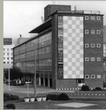
HERITAGE + PLANNING

upper level City Hall market place Hobart