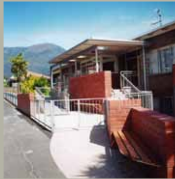
HOUSING + COMMUNITY

Paul Johnston Architects is a small Tasmanian based architectural practice with a broad range of experience and interest, centred on an ethical approach to design and sustainable development, to provide user friendly environments, supportive of community relationships, minimizing environmental footprints and sensitive to historic and urban context.